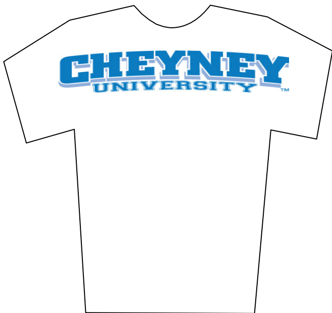
FRONT Across the chest (T-Shirts)