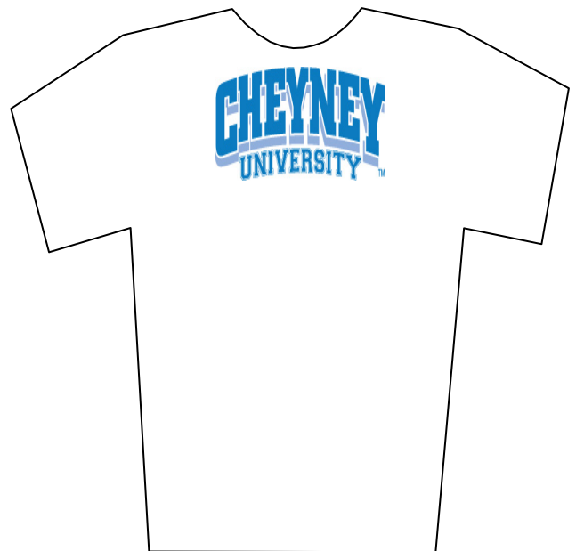
BACK- (Locker Style) Across the neck (T-shirts)