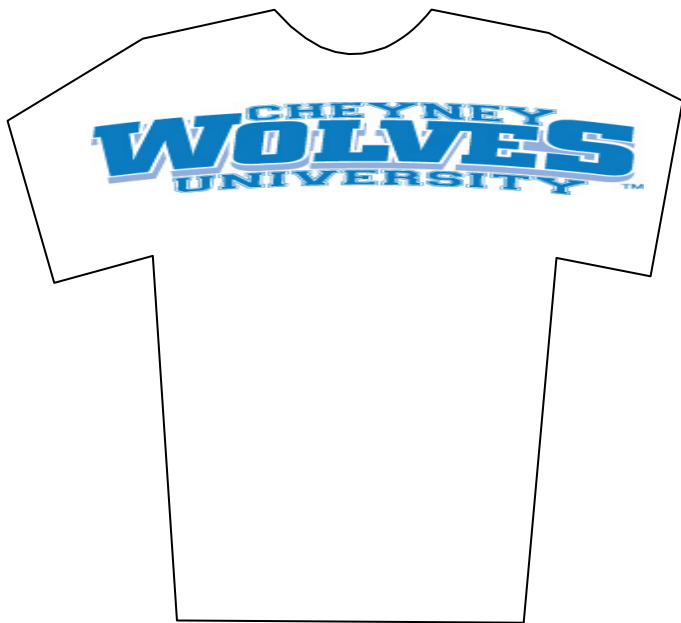
FRONT Across the chest (T-Shirts)