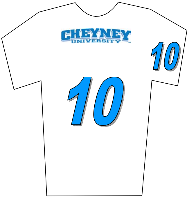
FRONT Above the chest (Jerseys)