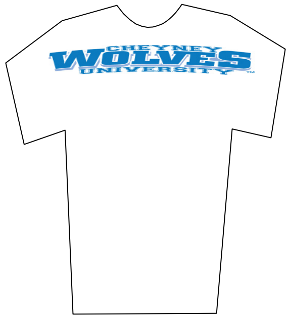
BACK Across the back (T-Shirts)